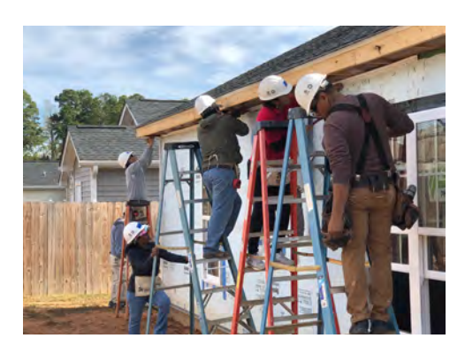
Santuario volunteers working on a Habitat house