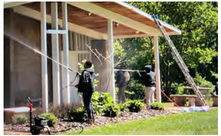
Members preparing Carolina Pines buildings for painting