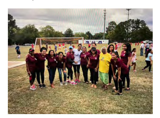
Women's volleyball team