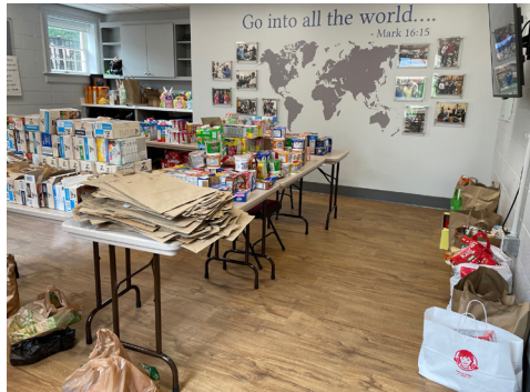
Thank you to the Weekday School for their generous donations of food that we distributed to Oberlin Middle School "Backpack Buddies".

We are a part of the Outreach Committee and our goal is to engage the whole congregation in providing basic supplies and volunteer services to those in need throughout our community. And your Outreach Service Committee has been very busy!