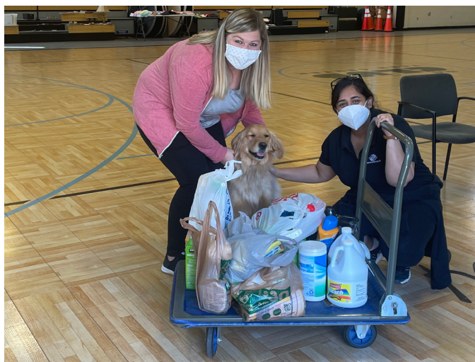
Collected and delivered cleaning supplies to The Boys & Girls Club of Wake County.