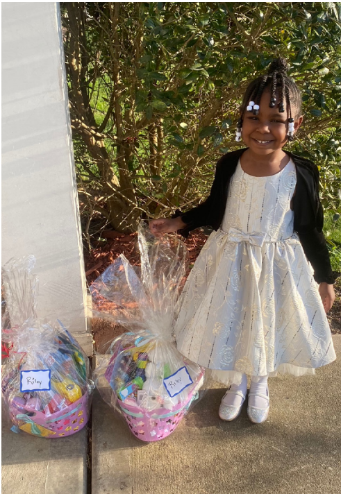
Thank you to everyone who contributed to the 75 Easter baskets that were packaged and delivered to StepUp and Mayview children.