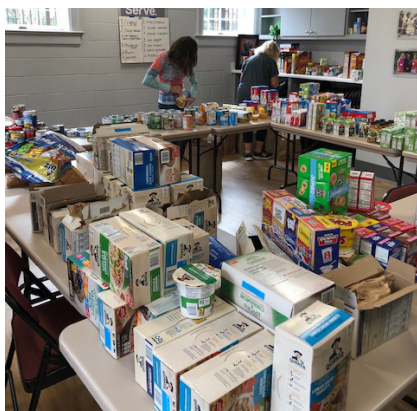
Service committee members package food donations from the Weekday School in the new Outreach Center in the Edinburgh Building.