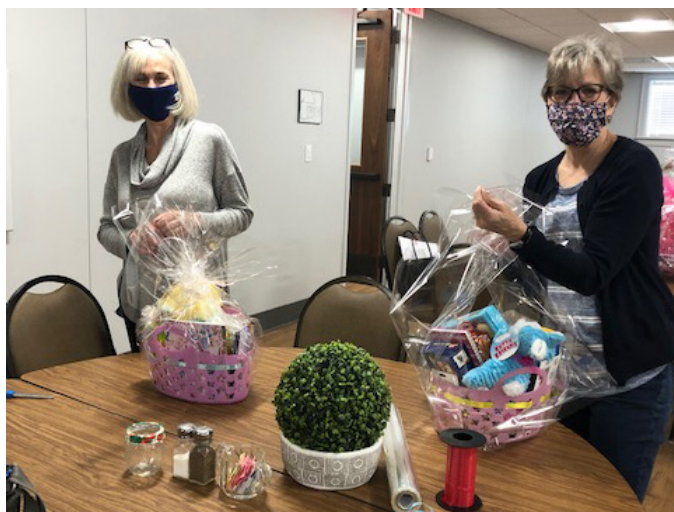
Wrapping Easter Baskets for children of StepUp and Mayview.

VISIT THE WMPC WEBSITE FOR EVEN MORE OPPORTUNITIES TO HELP. whitememorial.org/service/