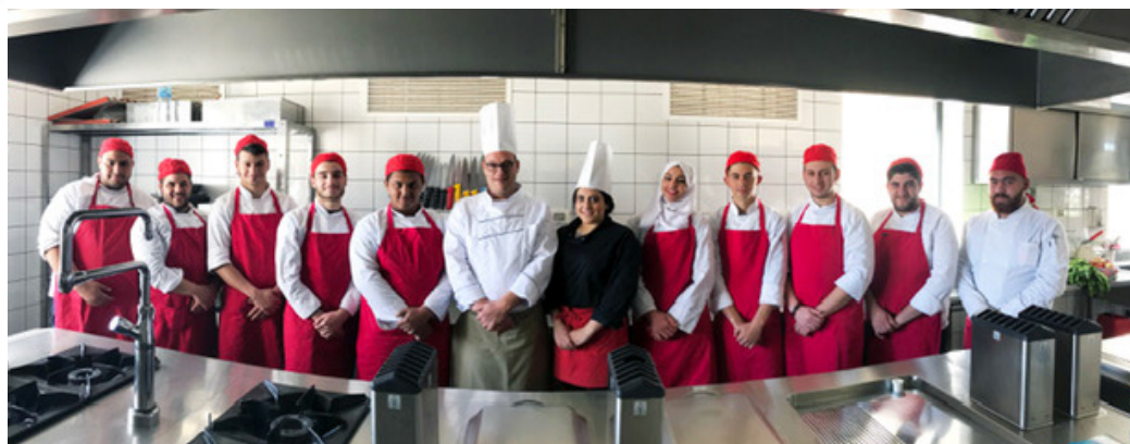
Bassem-Kitchen Culinary Arts Program.

On April 14 the Middle East Committee for Peace and Justice will present the film "For Sama" in which a young filmmaker chronicles the first year of her daughter's life against the backdrop of the cataclysmic conflict raging around them in the Syrian uprising. More information will follow.