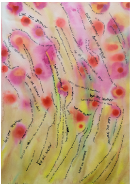
Morgan Riker, artist

The music used in today's worship services represents different cultures and time periods, including Japan, South Africa, 17th century Italy, and the folk traditions of Ireland.