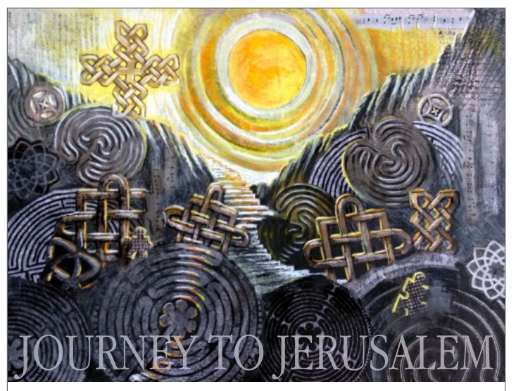
Psalm 130 Revisited © 2014. A visual interpretation in mixed media by Virginia Wieringa, virginiawieringa.com. Used by permission.