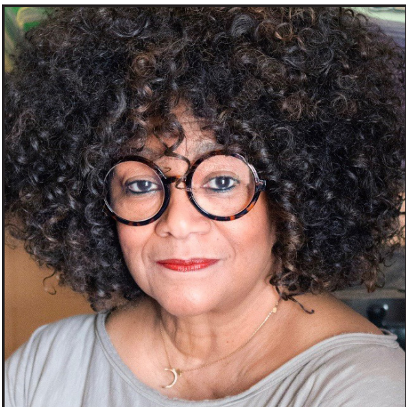
Jaki Shelton Green North Carolina Poet Laureate

As you think of yourself as your own curator or personal anthropologist...what is in your human museum? What are the rooms, spaces, containers you create for the telling, for the keeping, for the knowing, for your stories, your creativity, and for your validations as a writer?