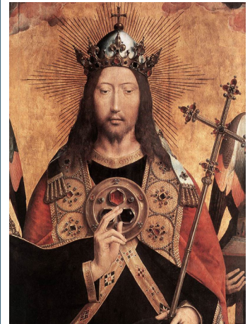
"Christ the King" - Hans Memling 15c.

Today is Christ the King Sunday. It is the final Sunday of the church year. Next week we begin the observance of Advent. Psalm 46 is about the majesty of God and the mighty acts of creation and faith which God provides.