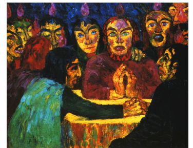
Emil Nolde "The Pentecost" 1909

This selection for bells and chimes uses two of our Glory to God hymn tunes: the first, found on page 278, and the second, found on page 11. The mixture of bells and chimes as well as the varied techniques of producing sounds add to the mysterious nature of the music representing Pentecost.