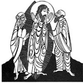
Moses, Jesus, and Elijah.